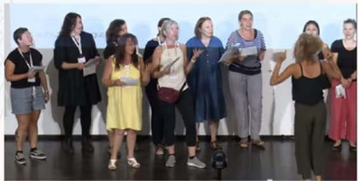
Abschluss der IDT 2022 - Internationale Tagung der Deutschlehrerinnen und Deutschlehrer

Although it is only September – in true German spirit our Oktoberfest kicked off in line with the Oktoberfest München!